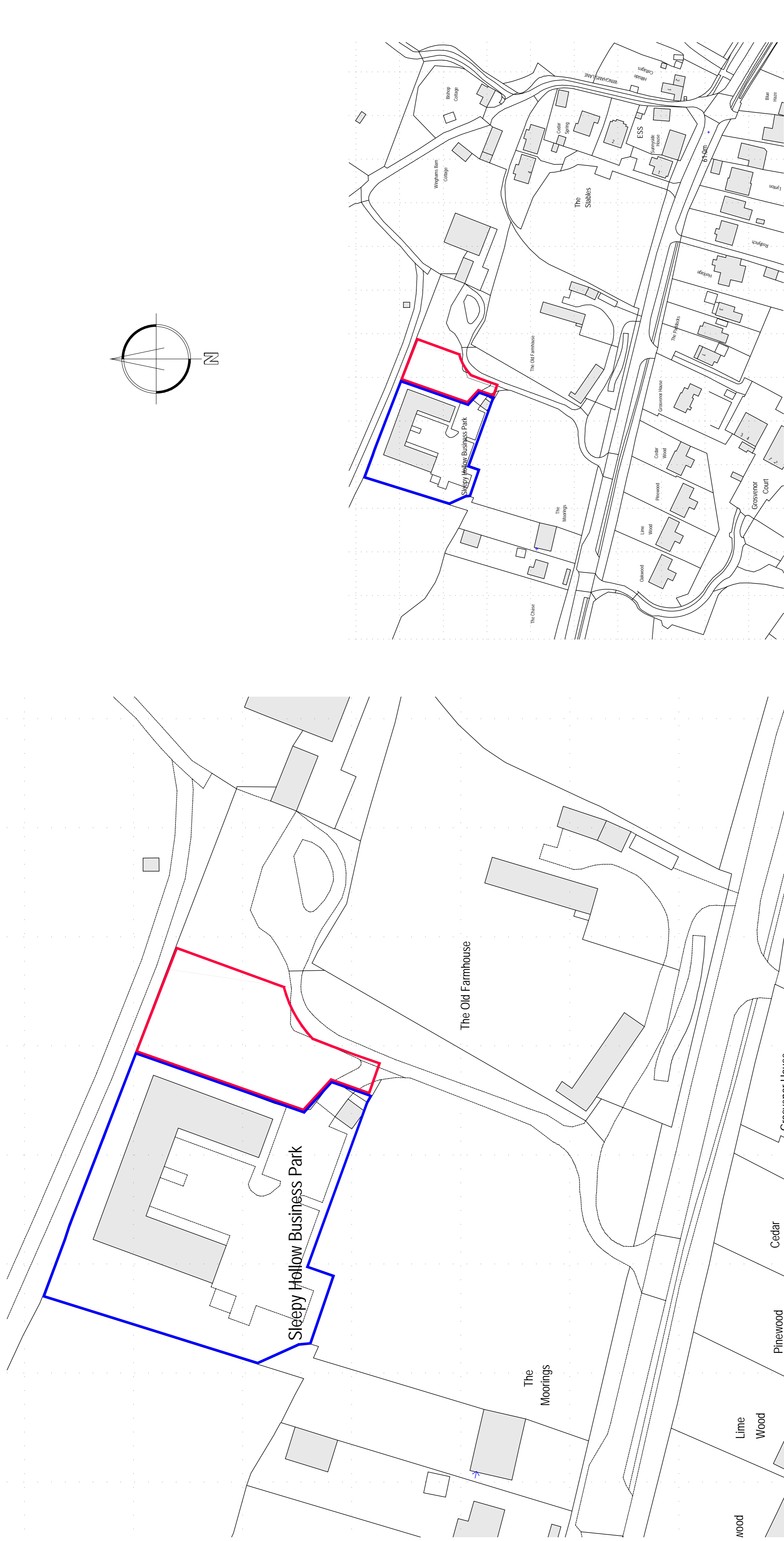
BLOCK PLAN SCALE 1:500 Ordnance Survey Licence number 10002432

OWNERSHIP BOUNDARY IS ASSUMED / APPROXIMATE ONLY AND IS TO BE CONFIRMED BY CLIENT.